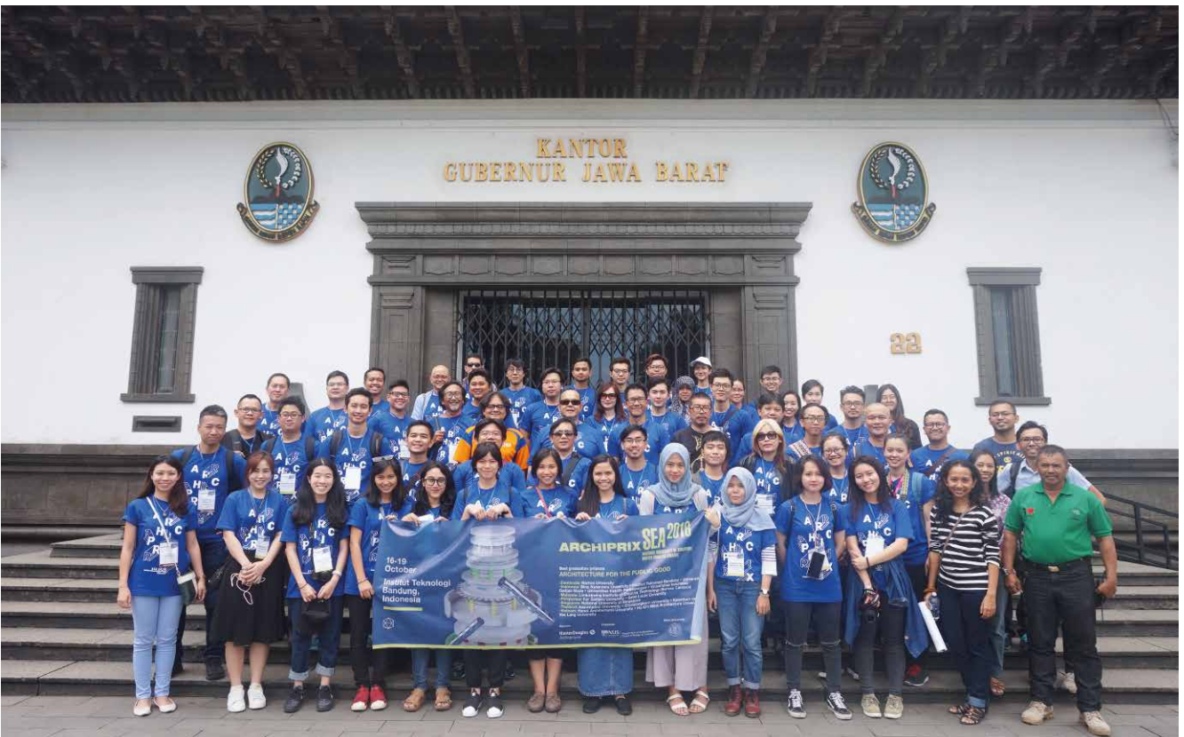
Architour group photo