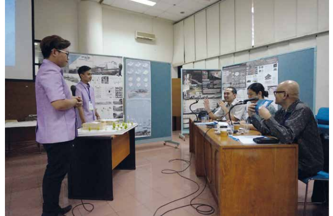
Competition and jury session.